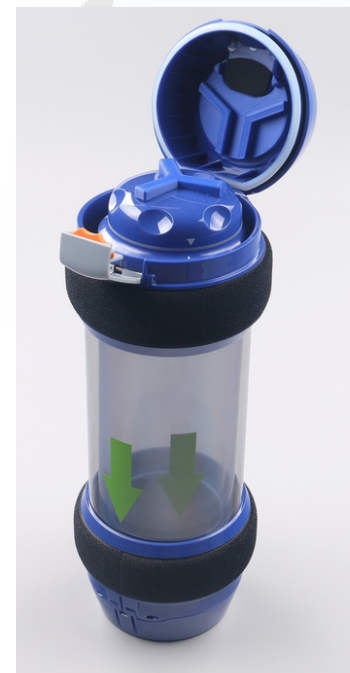
Leak proof cytosatics transport carrier