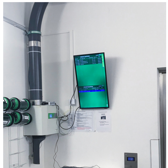
Combined Small Screen in a Hospital

The screens display either arrival or departure information only (two displays) or both information bundled (one display).