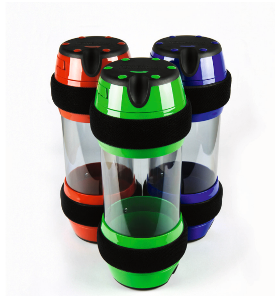
1.9350.T.1B in red, green and blue