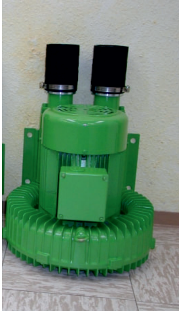
Blower Unit 1.2187.3.0C/1.2188.3.0C