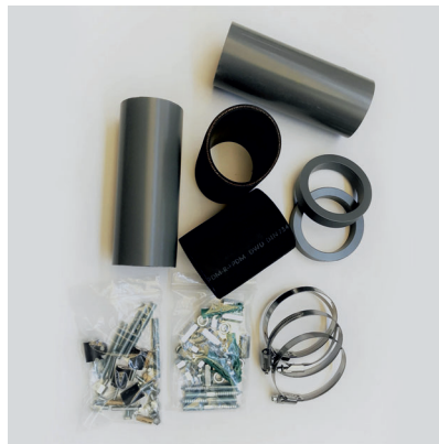
Installation Set 1.2187.6.80