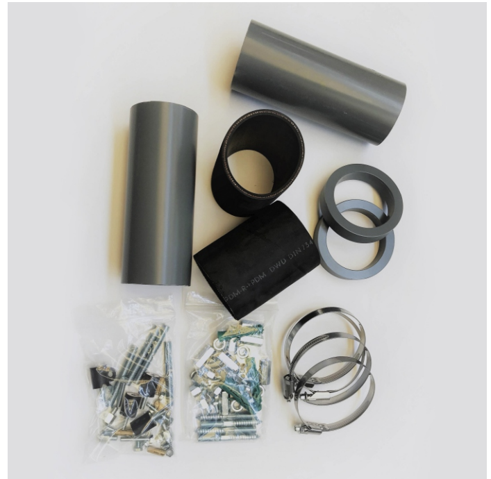
Connection Set 1.2184.6.80