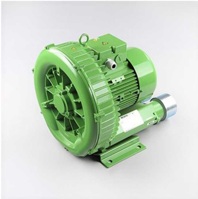
Blower Unit 1.2184.3.0C